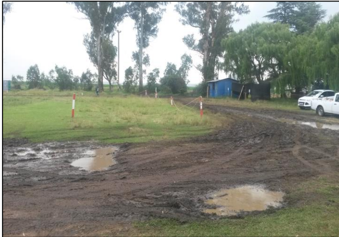
Figure 2: Heavy rains during this month

The following table presents examples of some of the site activities and observations