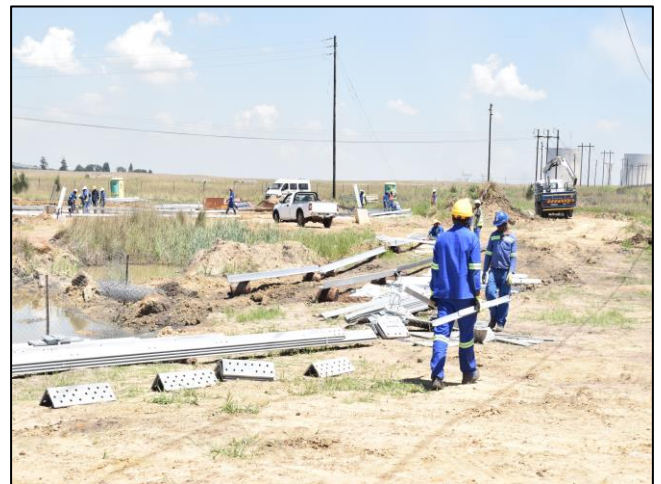
Figure 3: Assembling Tower