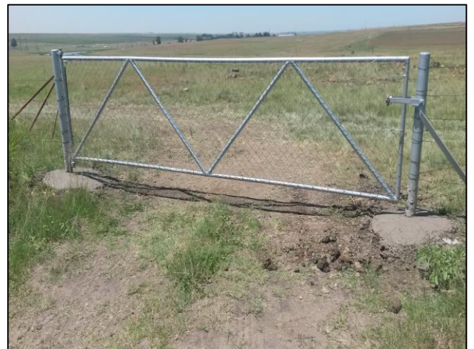
Figure 4: Gates installed on some farms