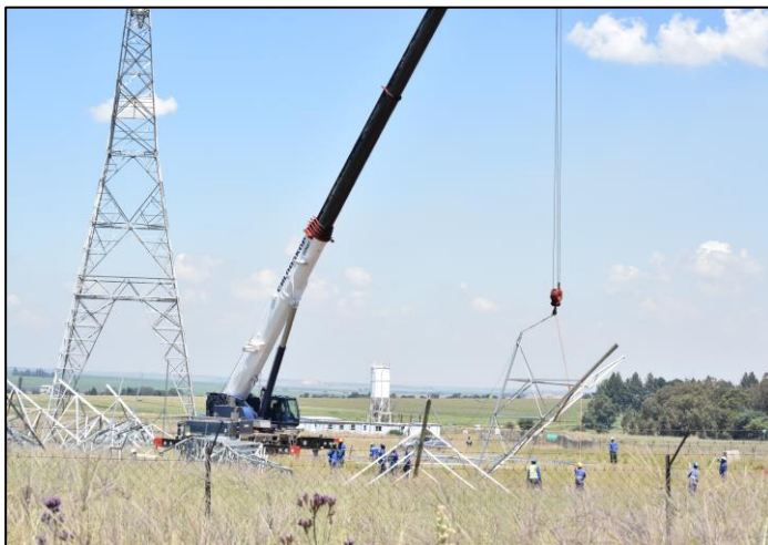
Figure 4: Erecting Tower